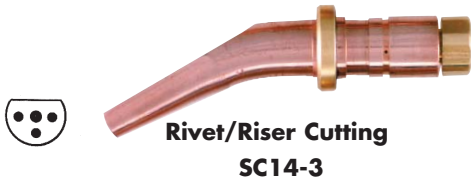
Rivet/Riser Cutting SC14-3

For edge preparation, removal of welds or gouging cracked metals.