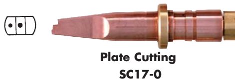
Plate Cutting SC17-0

Quickly removes large quantities of metal. Heavy preheat primarily used as a rivet blowing tip, but can be used for stud removal, metal washing, gouging, veeing and groove cutting.