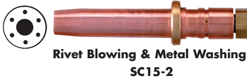
Rivet Blowing & Metal Washing SC15-2

Cuts heads of bolts and rivets. It can also be used in 180° head cutting torch to cut out boiler tubes. Works equally for cutting risers and bulk heads.