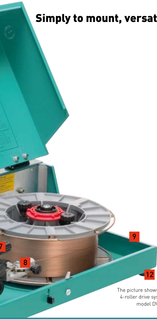
The picture shows the 4-roller drive system model DV-31.