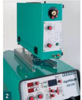
Vertical mounting of the wire feeder can be achieved in seconds.