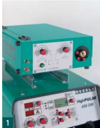
Standard horizontal mounting on the rotary device.