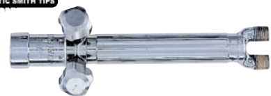
AW1A Length 5-3/4" (146mm) Weight 6-1/8 oz. (.17kg) Handle Diameter 11/16" (17mm) AW1A Valve Assembly Replacement AW11A