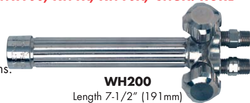
WH200 Length 7-1/2" (191mm) Weight 17-3/8 oz. (.46kg) Handle Diameter 1" (25.4mm)

USED WITH: Cutting Attachments - SC209, SC200, SC205, SC509 & DG205, DG209, DG200. Welding Tips - SW200 & 400 Series. Heating Tips - ST600 & ST800 Series.