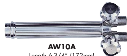
AW10A Length 6-3/4" (172mm) Weight 14 oz. (.39kg) Handle Diameter 15/16" (24mm) AW10A Valve Assembly Replacement LW17

USED WITH: Cutting Attachment - AC309. Welding Tips - AW200 Series, AW400 Series. Heating Tips - AT600 Series. Twin Flame Tips - AT600, AT600X6.