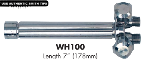
WH100 Length 7" (178mm) Weight 14 oz. (.39kg) Handle Diameter 15/16" (24mm)

USED WITH: Cutting Attachments - MC505, MC509 & DG105, DG109A. Welding Tips - MW200 & MW400 Series. Heating Tips - MT600 & MT800 Series.