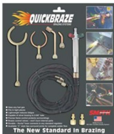
23-5005A (Adapts to A or B Style Regulator Connections)