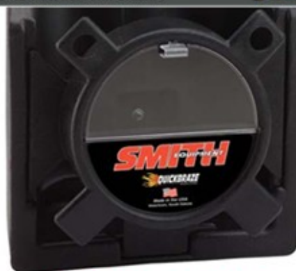
Caddy Kit - 23-5004A Tips Supplied Braze To 1-1/8" (29mm)